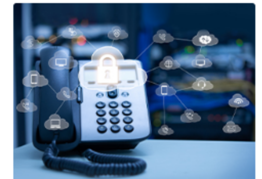
Features and Benefits